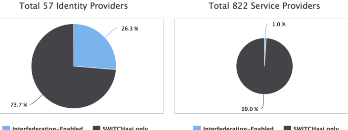
Total 57 Identity Providers

Find below the number of SWITCHaai Service and Identity Providers that enabled interfederation support (e.g. eduGAIN). This is to allow access to users from other education and research federations or to allow the own users access to such services world-wide. Please consult the list of interfederation organizations and list of interfederated services to get an overview about interfederated entities.