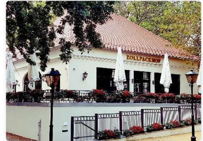
Zollpackhof: Located right across from the Federal Chancellery.