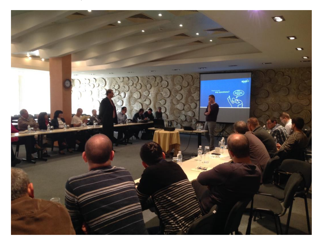
Figure 3.2: Cyber Security session in the Campus Networking and Security Workshop in Plovdiv, Bulgaria, 28 October 2015

The event was attended by almost 90 participants, mainly from Bulgaria, but also from neighbouring countries. The workshop programme was streamlined with planned development activities of the BREN community. The presentations (which referred mainly to existing developments in other countries) were very well received.