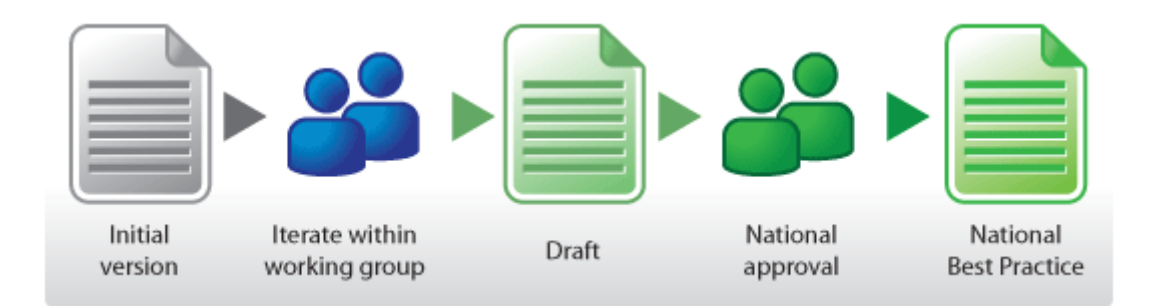
Figure 2.1: Writing process workflow for best practice documents (BPDs)

The writing process for the best practice documents has continued unchanged from the GN3plus project. The working groups are coordinated by the NRENs in their respective countries. The same working method has been adopted by the new NRENs that joined the work at the beginning of GN4-1. Appendix A gives an overview of the active working groups within each area in the contributing countries. Figure 2.1 shows the BPD workflow.