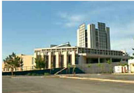
Figure 1. Central Library, meeting rooms on the ground floor